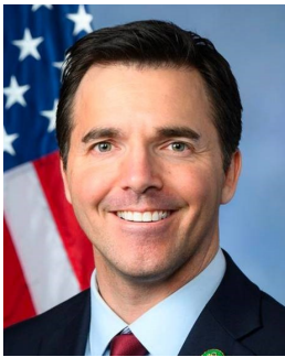
JEFF JACKSON DEMOCRAT

The AG leads the Dept. of Justice, which protects consumers, defends state agencies, and advises local law enforcement.